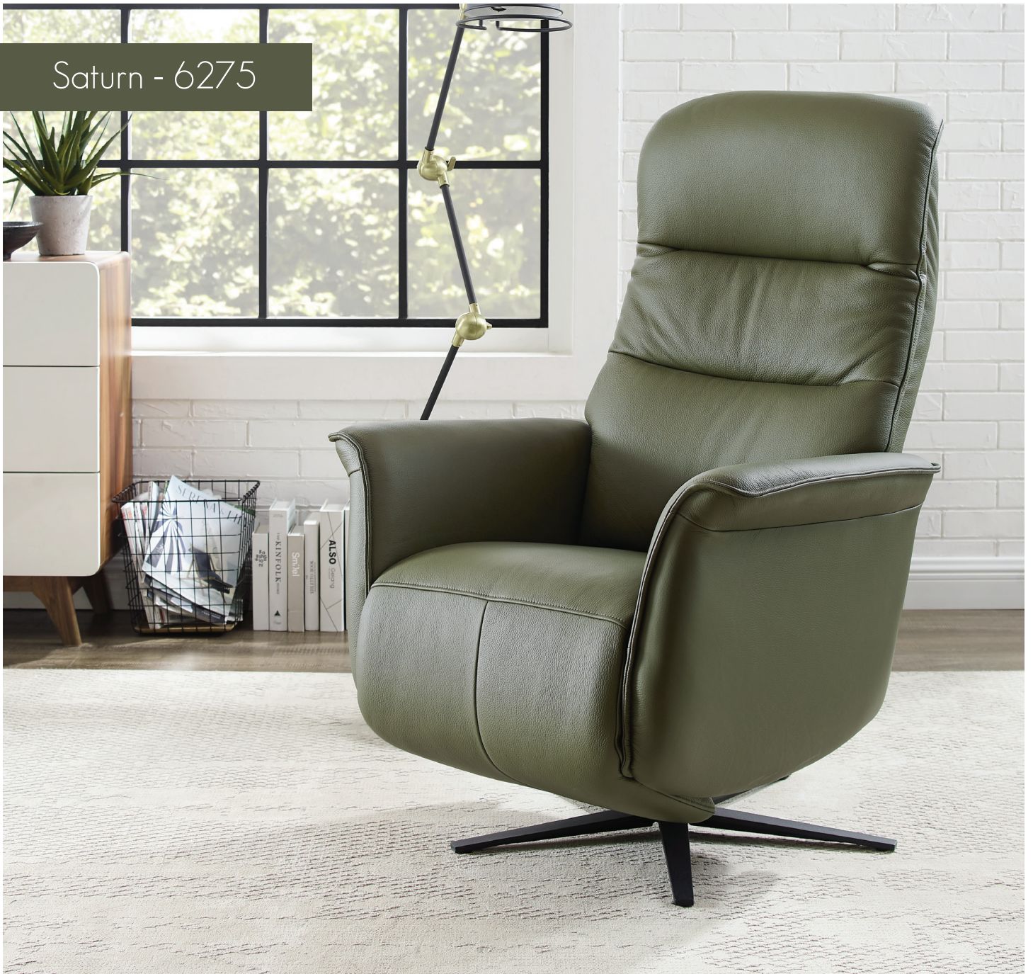
Saturn - 6275